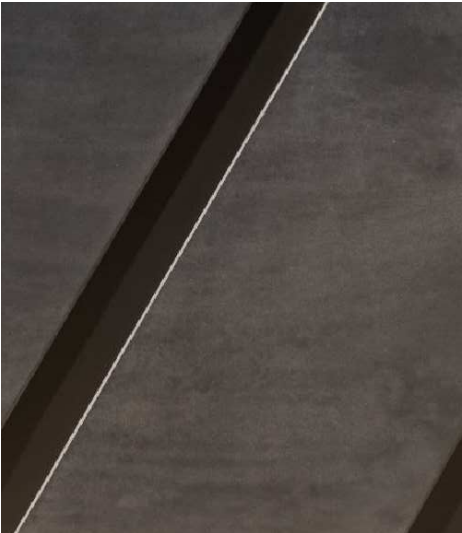
FIBRE CEMENT SHEET SOFFIT PREFINISHED COMPRESSED FIBRE CEMENT SHEET COLOUR - CHARCOAL