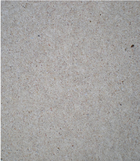
PRECAST CONCRETE CLADDING PRECAST CONCRETE CLADDING FINISH - ACID WASH COLOUR - CHARCOAL