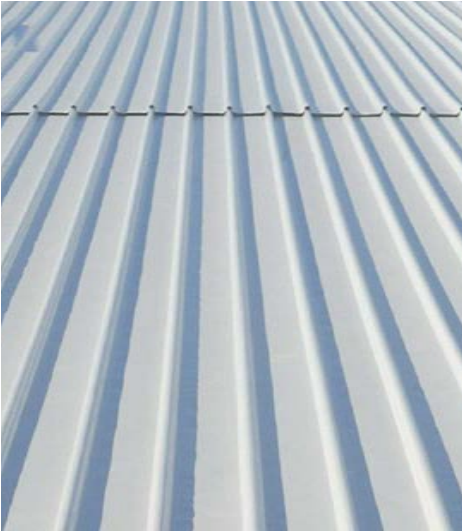
ROOFING CONCEALED FIX ROOFING SHEET COLOUR - WHITE