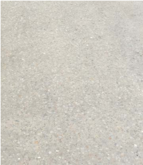
CONCRETE NON-SLIP BURNISHED FINISH