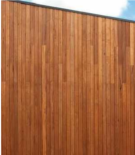
TIMBER CLADDING SEASONED HARDWOOD CLADDING FINISH - CLEAR COAT