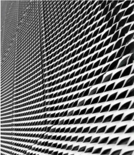
EXPANDED MESH CLADDING EXPANDED MESH SCREENS PANELS FIXED TO PAINTED CFC SHEET COLOUR - WHITE