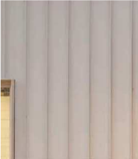
PROFILED STEEL CLADDING PROFILED STEEL CLADDING COLOUR - WHITE